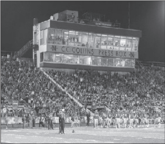
Thibodaux, LA June 13 - June 16, 2026